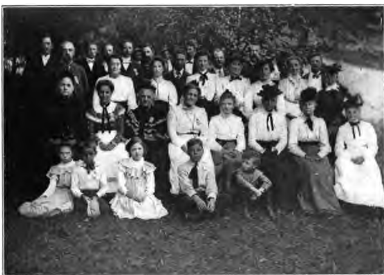
VII VIEW TAKEN AT ONE OF THE HILLMAN REUNIONS