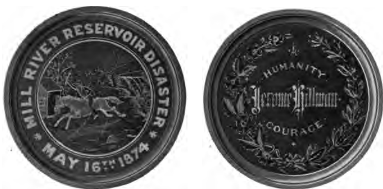
MEDAL AWARDED TO JEROME HILLMAN FOR BRAVERY IN CONNECTION WITH MILL RIVER DISASTER