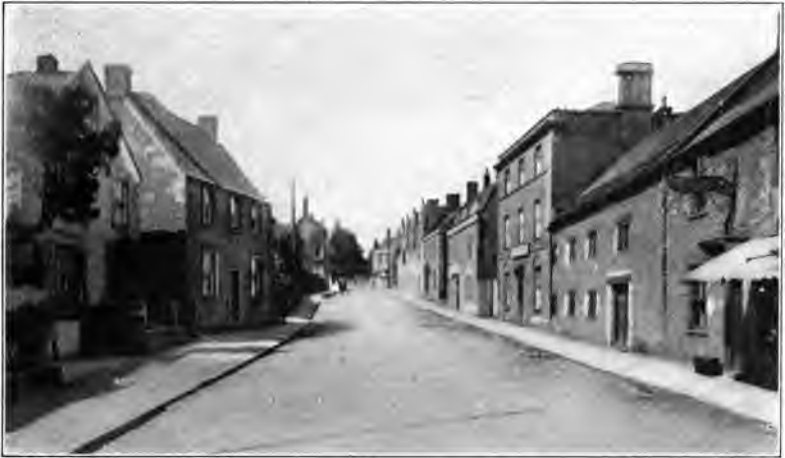
THE OLD HILLMAN HOUSE, BECKINGTON, SOMERSET, ENGLAND (ON THE LEFT)