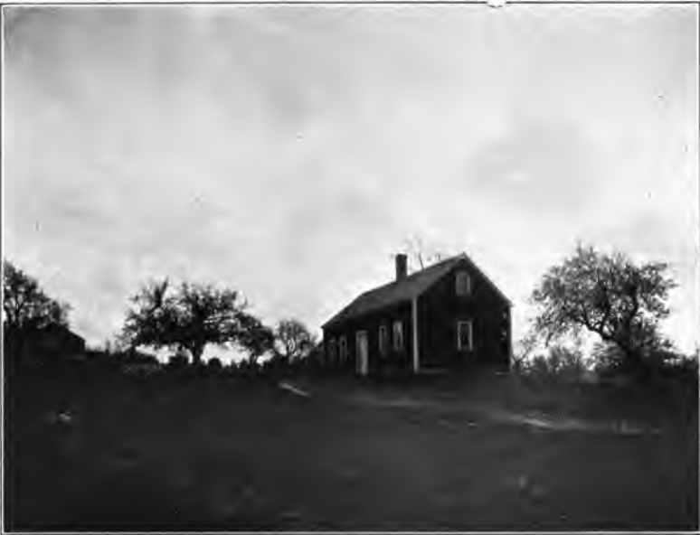
THE OLD HILLMAN HOUSE, CONWAY, MASS.