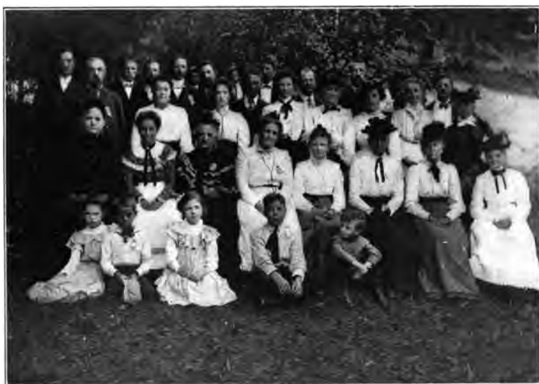
VII VIEW TAKEN AT ONE OF THE HILLMAN REUNIONS